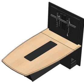
Code T526 Classic

526FR + 526RW (Choice of Single, Dual or XL Monitor Mount - Price Varies)